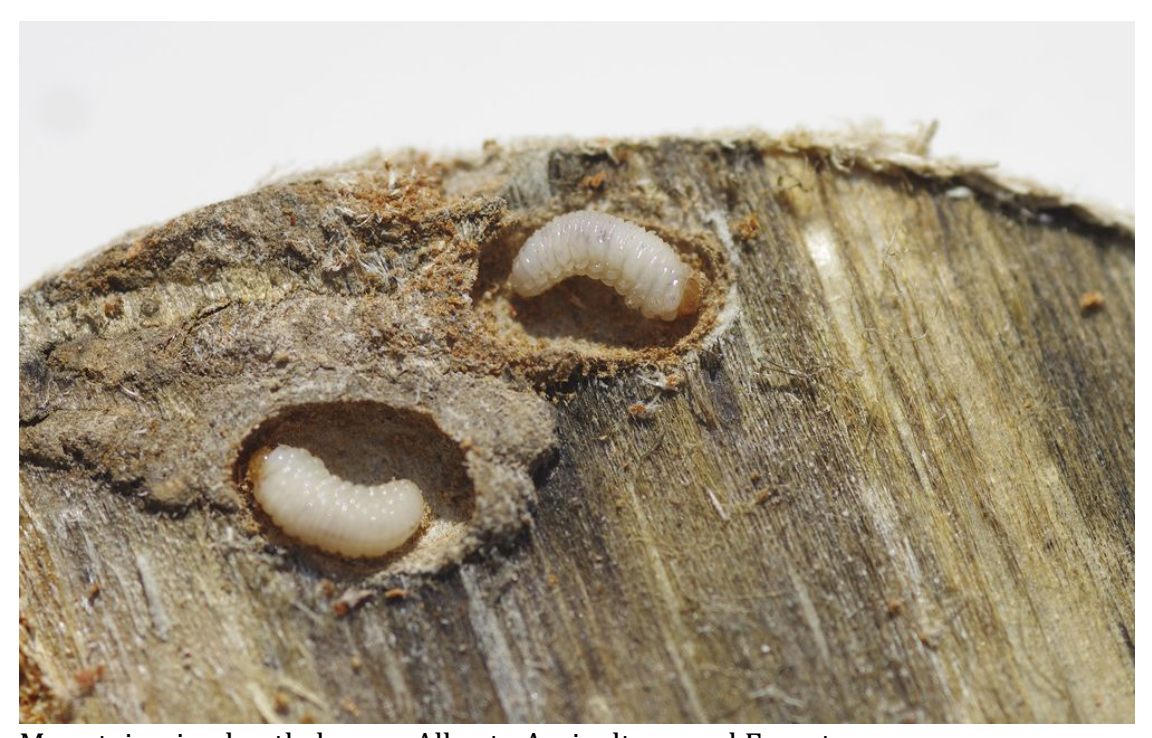
Mountain pine beetle larvae.

Canadian producers have already shifted their sights to the U.S. South, where they have bought mills and expanded their operations. Less than half of Canfor's lumber capacity comes from Canada, down from 88% just seven years ago, according to a company spokeswoman.